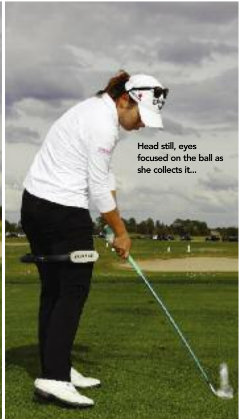
Head still, eyes focused on the ball as she collects it...