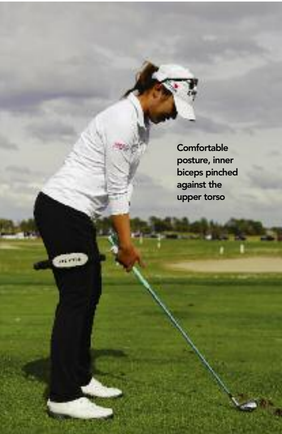
Comfortable posture, inner biceps pinched against the upper torso