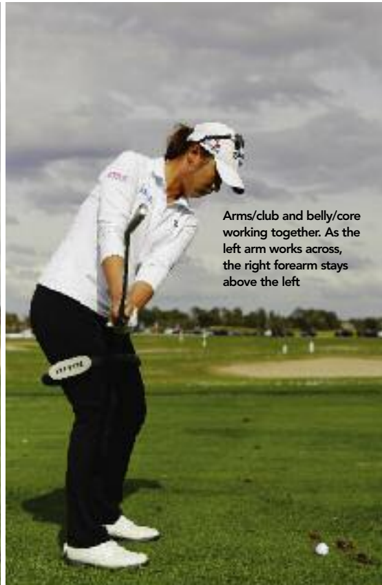
Arms/club and belly/core working together. As the left arm works across, the right forearm stays above the left