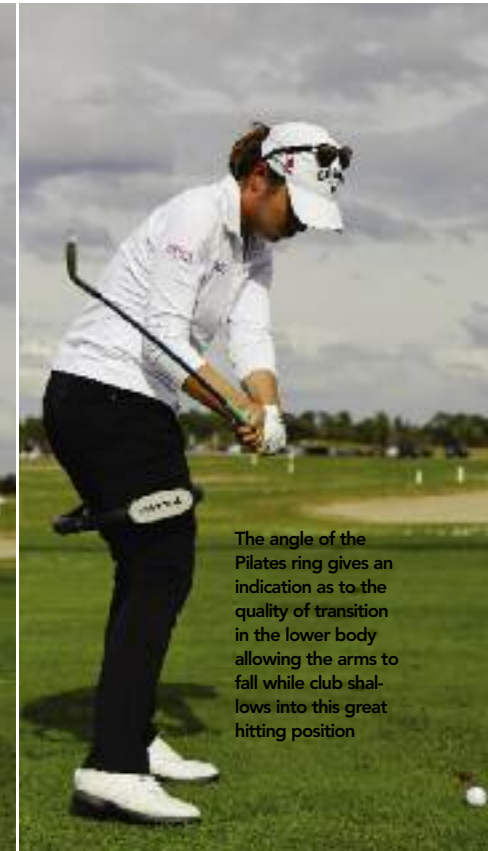
The angle of the Pilates ring gives an indication as to the quality of transition in the lower body allowing the arms to fall while club shallows into this great hitting position